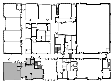
ENLARGED PLAN AREA